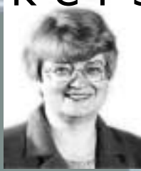
Margaret Bloodworth Deputy Minister, Transport Canada and Investment Champion for Sweden